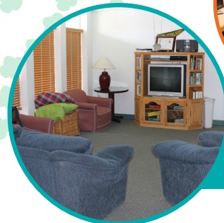
Hostel @ Program Center Spokane, Washington