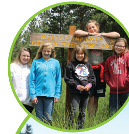
Martin Scout Ranch Pilot Rock, Oregon